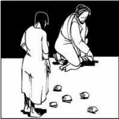
He bent down and wrote on the ground. Luke 8: 8

----- THOUGHTS ON STEWARDSHIP AS A WAY OF LIFE “...For his sake I have accepted the loss of all things and I consider them so much rubbish, that I may gain Christ...” Philippians 3: 8