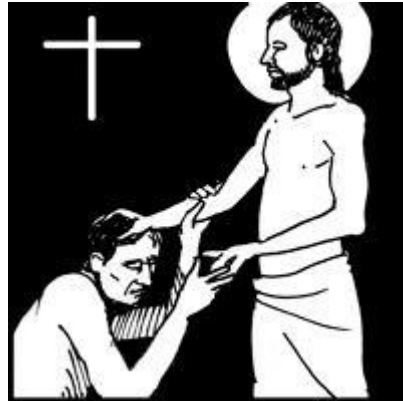
"Blessed are those who have not seen and have believed." John 20:29

+++++ THOUGHTS ON STEWARDSHIP AS A WAY OF LIFE