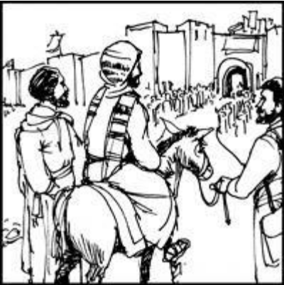
"Hosanna! Blessed is He who comes in the name of the Lord!" Mark 11: 10

+++++ THOUGHTS ON STEWARDSHIP AS A WAY OF LIFE “Pilate again said to them, ‘Then what shall I do with the man whom you call the King of the Jews?’ And they cried out again, ‘Crucify him.’” Mark 15: 12-13